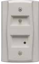
RTS151 UL S4011

System Sensor provides system flexibility with a variety of accessories, including two remote test stations and several different means of visible and audible system annunciation. As with our duct smoke detectors, all duct smoke detector accessories are UL listed.