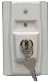
RTS151KEY UL S2522