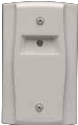
RA100Z UL S2522