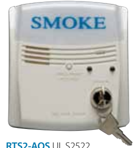
RTS2-AOS UL S2522