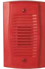
MHR UL S4011