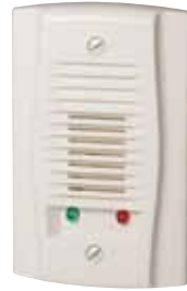
APA151 UL S4011