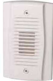
MHW UL S4011