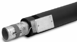
Figure 1. Surface Mounted Pipe Sensor.