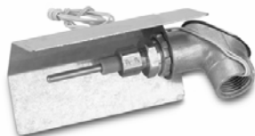
Figure 2. Outside Air Temperature Sensor.