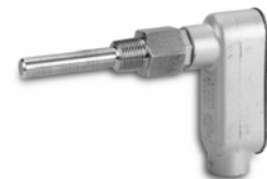
Figure 6. Liquid Immersion Temperature Sensor.