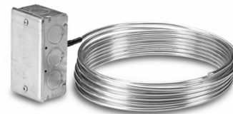
Figure 4. Duct (Averaging) Flexible Temperature Sensor.