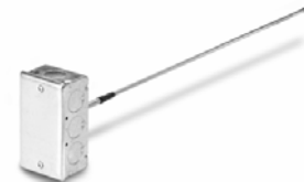
Figure 5. Duct (Averaging Rigid Temperature Sensor).